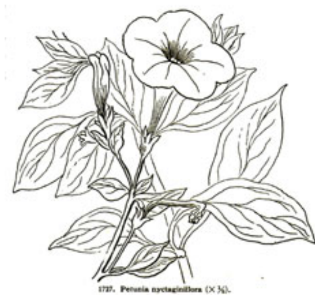
1727. Petunia nyctaginiflora (X 3/4).

vigorous, large-flowered Cascadia series (rivals the Supertunias in habit), and the double-flowered Doubleloon series and Marco Polo series. All are either trademarked or plant patented. Additional to the above are the outstanding new seed-propagated Wave and Tidal Wave series. Their spectacular spreading habit make them great choices for beds where a brilliant ground cover is desired. Unlike “regular” petunias, they continue to flower freely all summer without the need to trim them back. Tidal Wave exhibits excellent resistance to Botrytis, as well. A final new seed propagated series is the Morn series which is a miniature (or milliform) type of petunia. The series is characterized by compact plants with profusely borne small flowers and excellent weather tolerance.