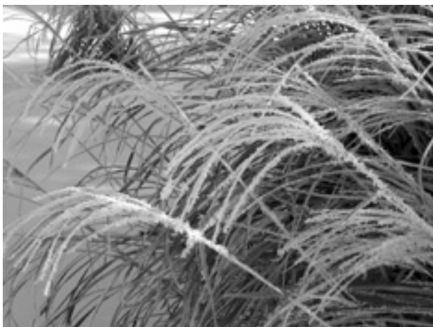
Ornamental grass lends texture to the winter garden.