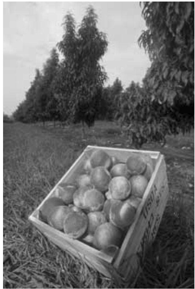
Bountiful Harvest from skinny peach trees.