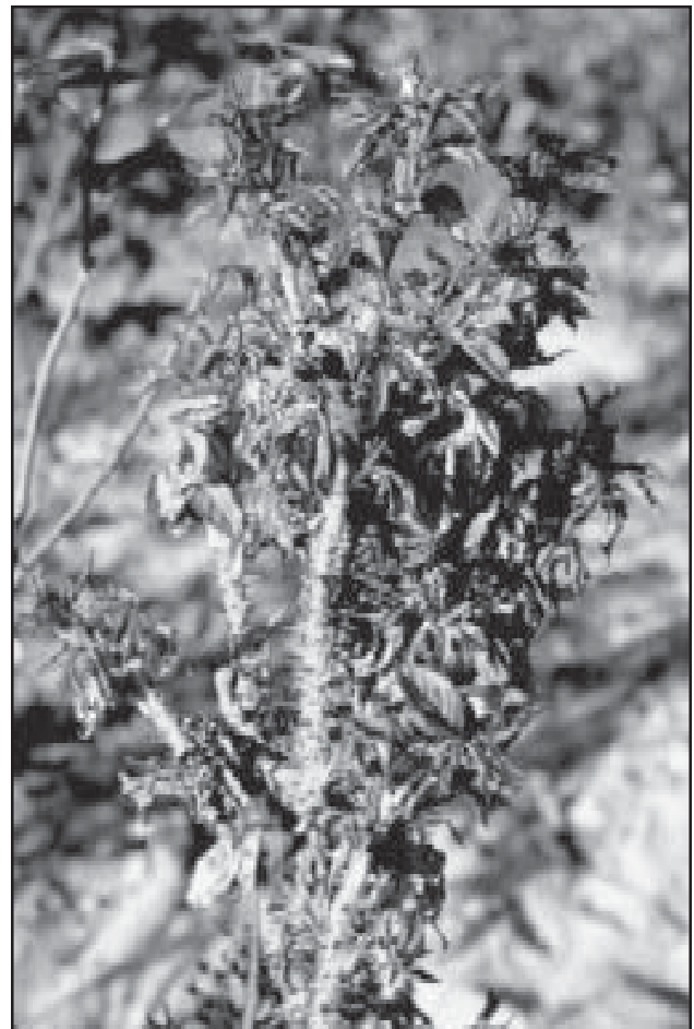
Symptoms of rosetting; deformity, reddish pigmentation and excessive thorns.

Some researchers have obtained reasonable control with Sevin; however, mites are very small and it can be difficult to get complete coverage. Also, use of Sevin to control eriophyid mites can lead to outbreaks of spider mites. The insecticide, Avid, is registered for control of both eriophyid and spider mites on roses. Use of miticides in the absence of cultural controls is not recommended. One way to use a miticide as an additional tool in a control program is to focus sprays on plants that surround spots where diseased plants have been removed. These are the most likely plants to which mites from within a planting would have moved. Spraying every two weeks from April until September should significantly reduce the mite population and the risk of transmission. Additional sprays may be needed during hot, dry weather when eriophyid mites are most active.