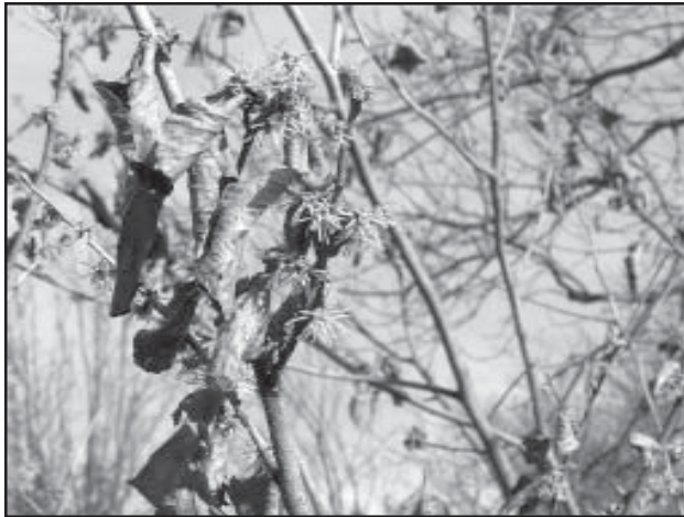
The yellow flowers of witch hazel.

Although we were mostly sitting in the lecture hall, there was some time to walk around the arboretum since the weather was clear and pleasant. In March we found witch hazel and black pussywillow in bloom. It was also a nice time to look for shrubs and trees that maintained interest throughout the winter. Several of the crabapples and other shrubs retained berries throughout the season and the red-stemmed dogwood added color to the landscape.