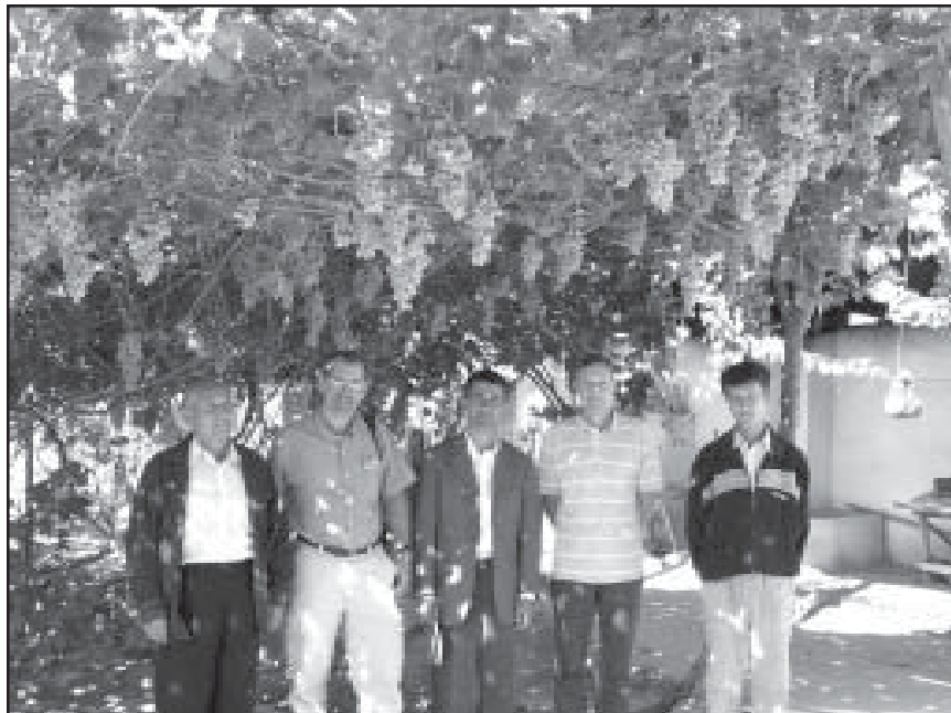
A crop of table grapes in a dehkan hojalik courtyard garden.