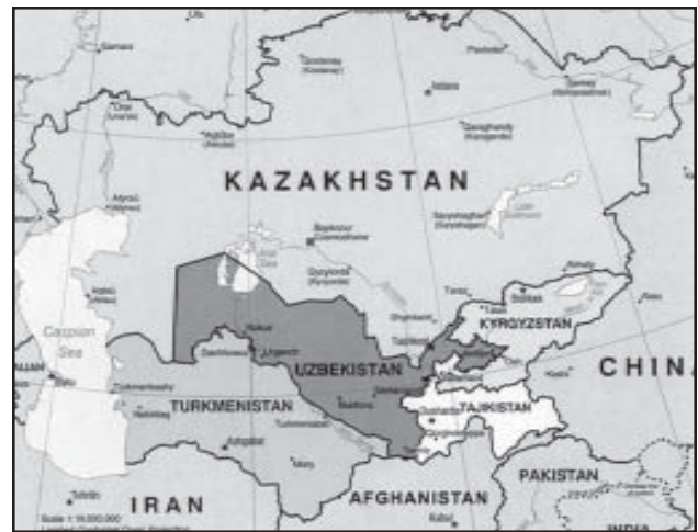
Uzbekistan is located in the heart of central Asia.

Uzbekistan is one of the five independent nations collectively known as the Central Asian Republics. All of these nations were previously associated with the Soviet Union until the early 1990s, when all became independent following the collapse of the USSR. Of these five nations, Uzbekistan, Kazakhstan, Kyrgyzstan, Tajikistan, and Turkmenistan, Uzbekistan has emerged as the most influential and has developed into a regional power. This region of the world is of increasing strategic interest to the U.S., in part because of its geographic location relative to China, Russia, and countries such as Afghanistan and Iran.