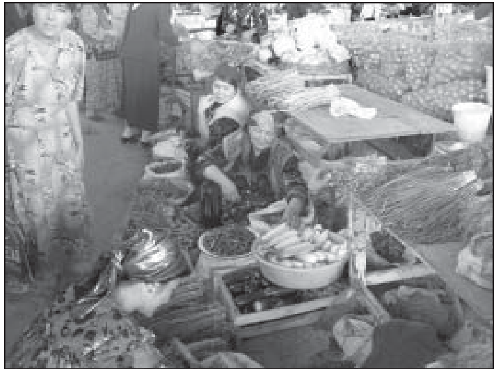
The bazaar is an important local market for Uzbek horticulturists.

Also a product of land reform, the dehkan hojalik farm is often characterized as the household plot. Limited by law to less than 1 hectare, these farms are critically important, as they produce more than 75% of non-wheat food crops in Uzbekistan and the majority of horticultural crops. These farms