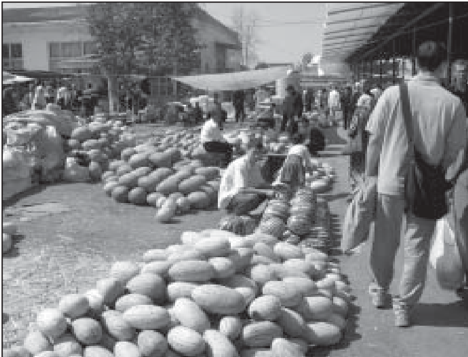
The melon market at Andijon bazaar.

A product of land reform are firmer hojalik farms. In many cases the firmer hojalik farm, which