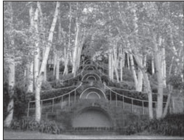
A photo of the blue steps in Naumkeag's Gardens designed by Fletcher Steele.