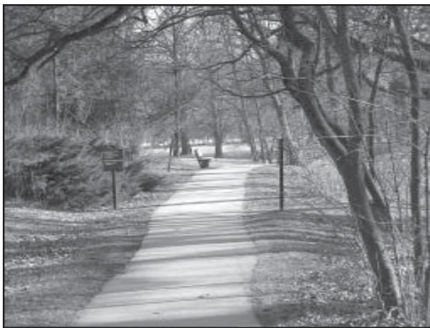
A walking trail at the arboretum.

Steven Silk, a renowned photographer, presented the first lecture, “The Quest for Color”.