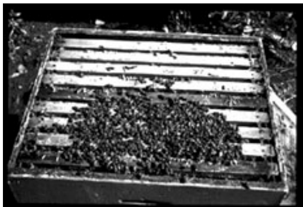
Poor pollinating unit with 4 frames of bees (above).

With the loss of hobby beekeepers and feral honeybees the importance of commercial beekeepers and their honeybees in pollination is important to the growers of fruits and/or vegetables. Growers need to know the basics of good pollination and what to expect from rented honeybee colonies. In Missouri, growers are generally small and there is generally good habitat for native species of bees to survive but rented honeybee colonies can insure the best crop possible. Growers need to learn about pollination and the pollinators of their crops.