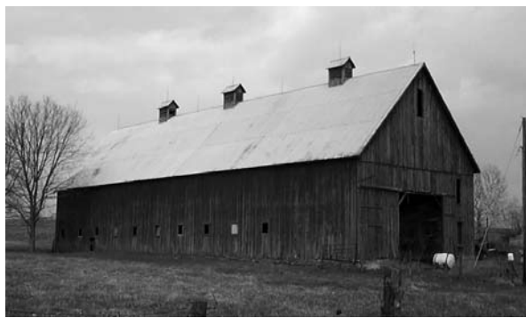
Jack stock barn on the Monsees' Limestone Valley Farm.