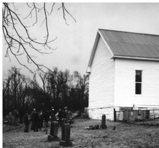
The Kelley Cemetery in Ash Grove, Mo.