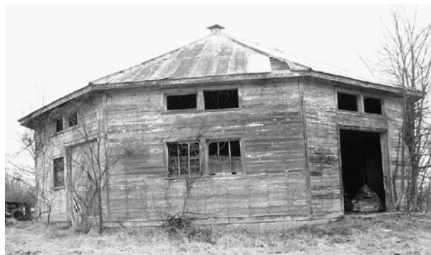
Dairy barn moved from the 1904 Worlds Fair to Farmington, Mo.