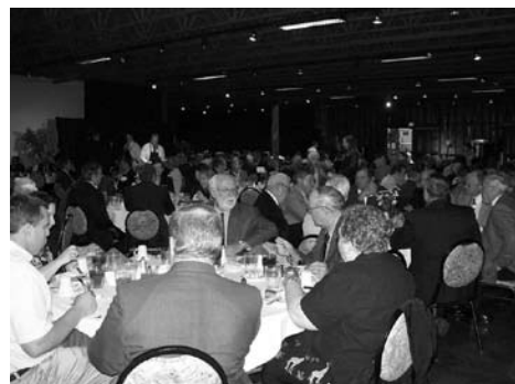
Guests enjoying dinner at the Agriculture Forum. There were 200 guests and alumni in attendance, the largest attendance in the event's history.