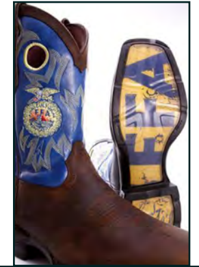
These boots are really special!

agricultural education, several students at MSU set out to present the boots at area FFA banquets. Students of Jim Bellis' agriculture leaders class presented the boots to the area officers of areas 9, 10, 11 and 12 and explained the benefits the boots have for FFA and MSU.