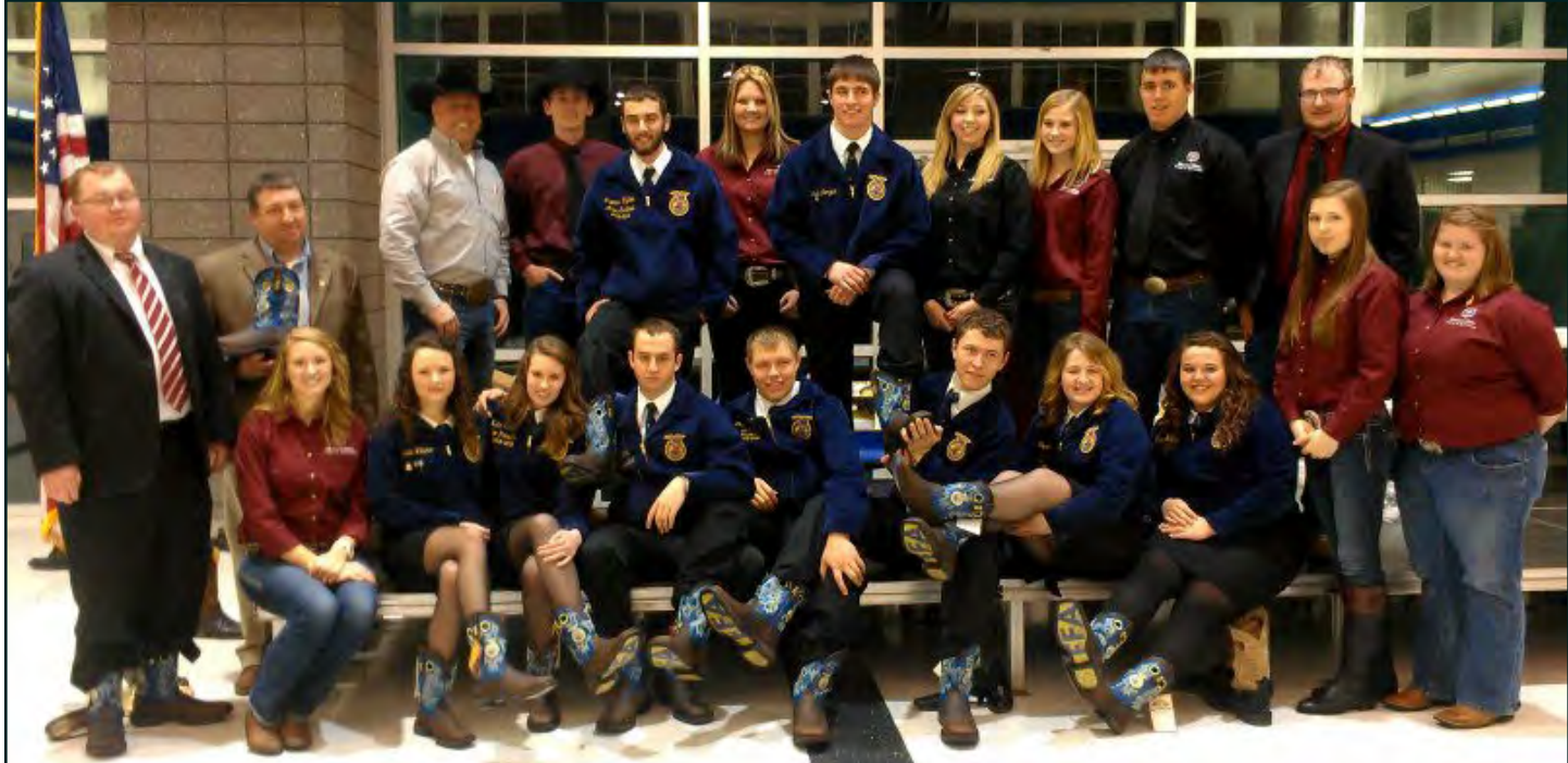
Members of the Ag Leaders class and representatives from PFI Western Store present boots to Area 9 Officers.