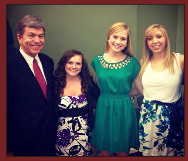
Senator Blunt visits with agriculture students.