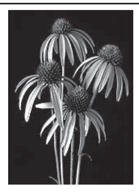
Orange Meadowbright<sup>TM</sup> Hybrid Coneflower from Chicagoland Grows ^{\mathbb{R}} Inc.

encountering the same thing with green ash and the emerald ash borer.