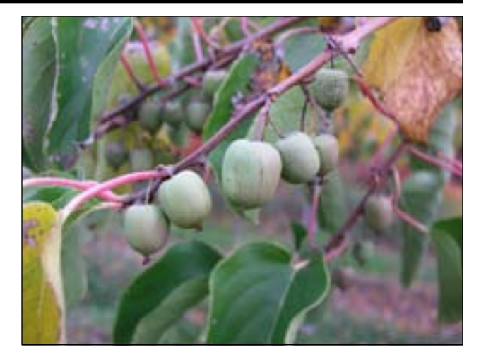
"Passion Popper" hardy kiwi fruit

Upon arrival at Kiwi Korners we were greeted by David and immediately hiked out to a production plantation. David has evaluated over 50 different hardy kiwi cultivars and selections and has settled on 2 as the best cultivars at Kiwi