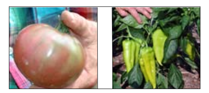
Heirloom tomato and peppers from grown for rich flavor

We are anxious to see how Ivan's "experiment" in fig production develops. Several things need to be worked out including pruning to keep the plants in bounds in the heated hoophouse, the best plant spacing for the long term, pruning practices and so on. Ivan also produces other crops for the fresh market. In keeping with his first priority - quality - Ivan chose particular heirloom tomatoes and peppers from his ancestral home of Bulgaria "because the others just don't have flavor!"