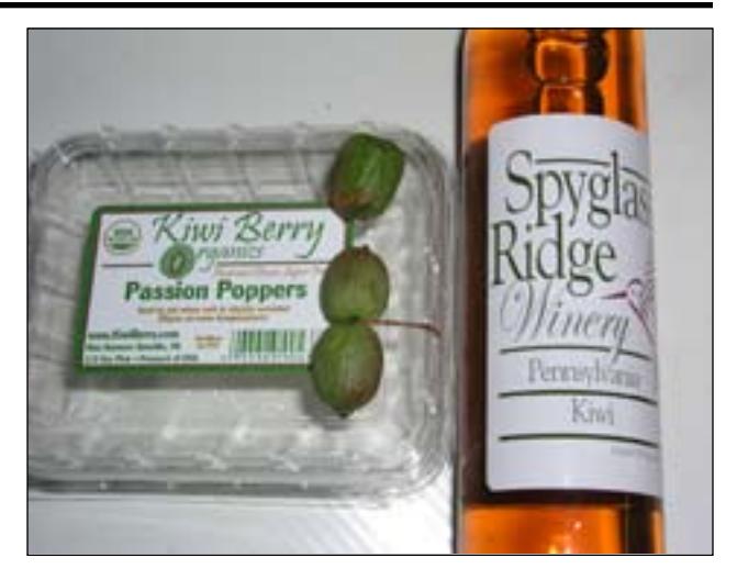
Hardy Kiwi marketing ideas

Hardy kiwi vines are in full production in 4 years, and a vine may produce 60-100 pounds of fruit. Fruit is sampled as the fall harvest time approaches, and harvest begins when the fruit reaches 9°brix sweetness. The fruit is firm when harvested, and fruit is removed from