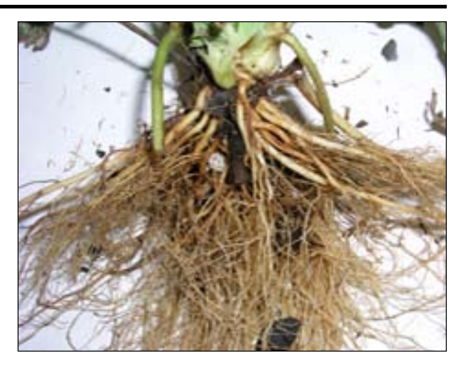
A well grown plant has an extensive root system, including a number of roots formed since transplanting (note the large roots).

A healthy strawberry plant is well rooted, and is difficult or impossible to pull up by hand without damaging the crown. Dig up the plant with a spade, and examine the root system. The plant should have a number of large, healthy roots that originate from the crown area above the original plug root system. These roots will be pale in color, and will exhibit numbers of smaller first and second order roots. Next cut the roots just below the crown, and examine the root cross sections. Healthy roots have a pale