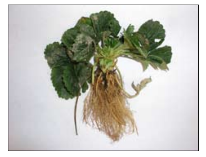
A well grown strawberry plant, with a crown diam eter of 8 inches

Annual plasticulture strawberries are typically planted in late September or early October in Missouri, and plants must make sufficient growth during the fall to ensure a profitable harvest the following spring. Growers have the opportunity to prolong the growing season in the fall through the careful use of floating row covers and proper fertilization, but it is important not to "over grow" plants, with the resulting excess growth the next spring adversely affecting production. Fall management is thus a balancing act, and proper assessment of plant growth is critical. This article will focus on physical assessments of plant growth. A good time to assess plant growth is 6-8 weeks after planting, in November. Growers should focus on the following plant characteristics: plant spread and leaf development, branch crown development, and root development.