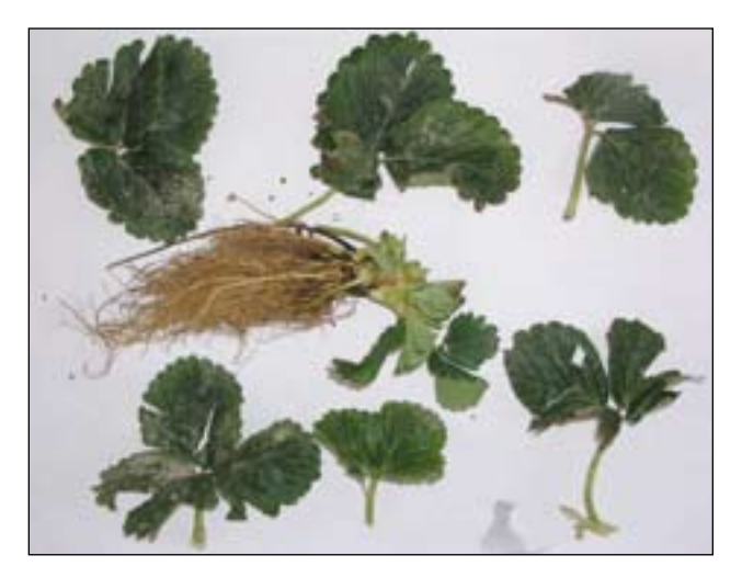
This plant has 6 healthy leaves.

Collect a sample of plants that adequately represents the field. Before digging, measure the plants. Plants should be 7-10 inches in diameter. Next count the fully developed leaves. A well grown plant will have 5-7 healthy leaves that have formed after transplanting. Don't count the small leaves that were present on the plug plant at transplanting. The leaves should be dark green, and should not exhibit evidence of spider mite injury.