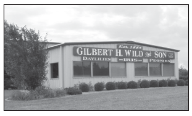
The nursery office in Sarcoxie, Missouri.

A vintage garden border in front of Faurot Hall, the historic administration building at the Fruit Experiment Station at Mountain Grove, is being developed to honor the Southwest Missouri State University Centennial in 2005. The first steps in planning this garden involved research into turn-of-the-last century gardens. Roses, daylilies, peonies, species geranium, lavender, yarrow, coreopsis, sedum and ornamental grasses are some of the plants used at the time. While looking for sources of old fashioned plants, we luckily discovered a treasure trove of vintage peonies right here in Missouri at Gilbert H. Wild and Son Nursery in Sarcoxie.