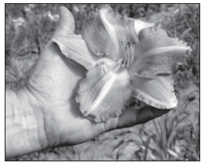
The traditional daylily developed by Wilds is large, star-shaped and without markings.

Wilds nursery has introduced many cultivars through the years. The original "Wilds" style daylily was a large-sized, star-shaped blossom without an eye. Greg now concentrates on selecting daylilies for marking at the eye (center), for contrasting color at the edge, for good texture and thickness, for double form, and for resistance to thrip (insect) damage. The bud count of a fully mature (4-5) year-old) daylily ideally is from 20-30.