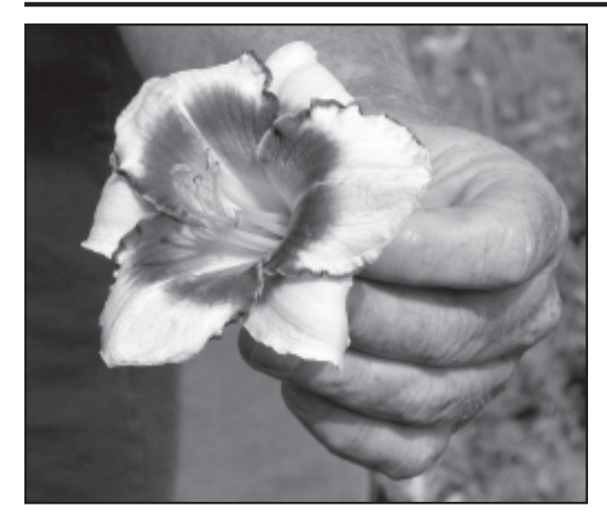
A character currently selected in the breeding program is a contrasting colored edge.