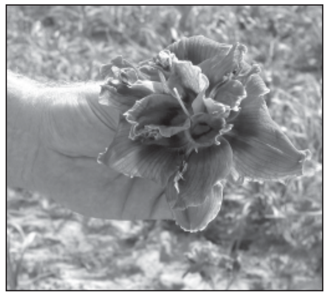
The double character is another newer trait selected in the Wild breeding program.

At Wild's, there are about 400 acres in flower production on several farms. Irrigation water is applied in a pivot system. Flower crops are rotated with cover crops of oats or soybeans. The focus of the operation is to produce high quality plants and to insure trueness to name. In fact, Greg has two full-time employees who continually inspect the fields and remove any plants that are not true to name during blossom. To further insure quality and trueness to name, every order is fresh dug by hand.