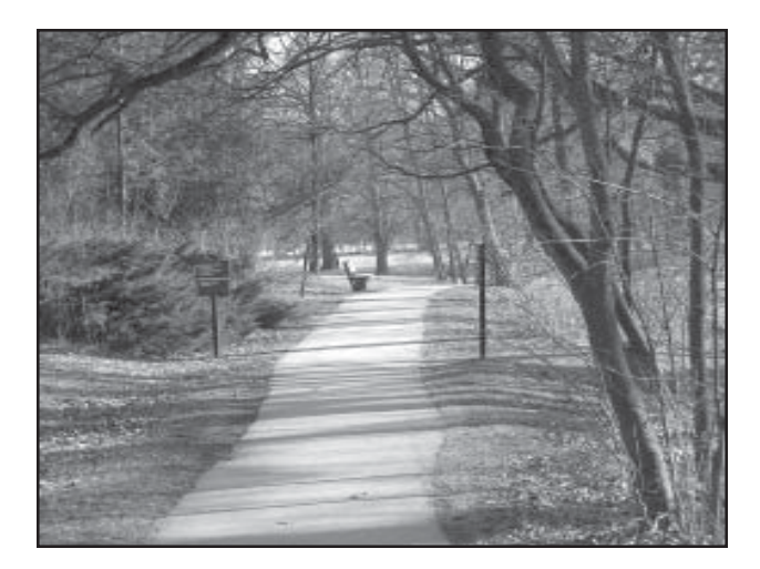
A walking trail at the arboretum.

Steven Silk, a renowned photographer, presented the first lecture, "The Quest for Color".