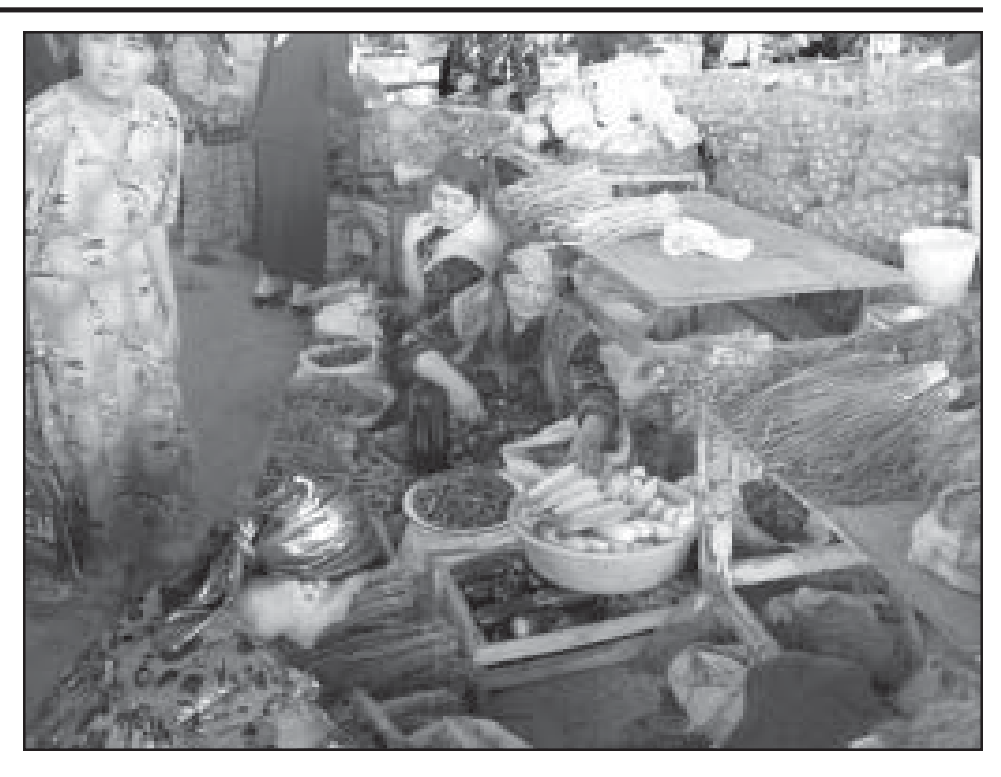
The bazaar is an important local market for Uzbek horticulturists.

is typically 5-100 hectares in size, includes land from a local shirkhat that is leased on a long term basis. Often the hojalik farmer was formerly connected with state farm leadership and obtains land through wealth and political connections. The long term leases may be inherited. Although nominally independent, firmer hojalik farms often rely on a neighboring shirkhat for inputs, and may be subject to production orders. A wide range of horticultural crops are produced on firmer hojalik farms.