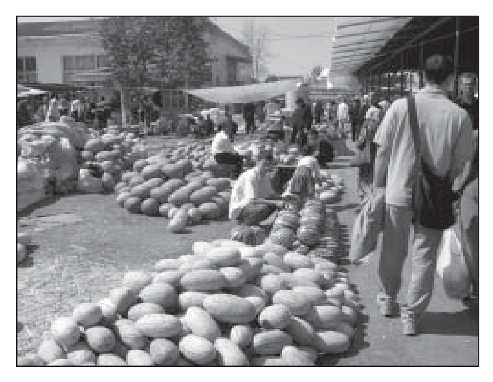
The melon market at Andijon bazaar.

Following independence, the collectivized state farms (kholkoz) of the Soviet era evolved into the shirkhat farms. In most cases the shirkhat is a continuation of the kholkoz, including the same leadership. Certain shirkhats are innovative, while others are indistinguishable from Soviet times.