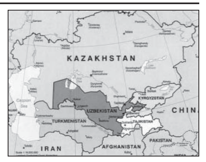
Uzbekistan is located in the heart of central Asia.

Uzbekistan is one of the five independent nations collectively known as the Central Asian Republics. All of these nations were previously associated with the Soviet Union until the early 1990s, when all became independent following the collapse of the USSR. Of these five nations, Uzbekistan, Kazakhstan, Kyrgyzstan, Tajikistan, and Turkmenistan, Uzbekistan has emerged as the most influential and has developed into a regional power. This region of the world is of increasing strategic interest to the U.S., in part because of its geographic location relative to China, Russia, and countries such as Afghanistan and Iran.