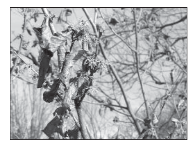
The yellow flowers of witch hazel.

Although we were mostly sitting in the lecture hall, there was some time to walk around the arboretum since the weather was clear and pleasant. In March we found witch hazel and black pussywillow in bloom. It was also a nice time to look for shrubs and trees that maintained interest throughout the winter. Several of the crabapples and other shrubs retained berries throughout the season and the red-stemmed dogwood added color to the landscape.