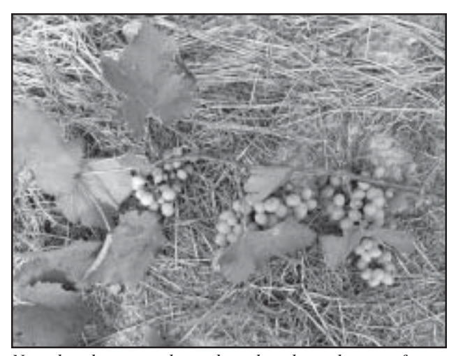
Note that the grape shoot above has three clusters of grapes on it. On large clustered varieties, these clusters should be thinned to one or two clusters per shoot.

Looking at the shoots of your grapevines, you can see that many shoots produce two clusters of grapes, sometimes even three or four, depending on the variety. Some varieties (for example Concord and other table grapes, as well as the wine grapes Seyval blanc, Vidal blanc, Chelois, Catawba, Niagara and others) also produce very large clusters. In the case of table grapes, these clusters can weigh up to a pound. In these large clustered varieties, what seems like a small number of clusters on a vine, can equal many pounds of grapes per vine. These varieties would benefit from cluster thinning. Varieties that produce often only one cluster per shoot or that have small clusters (Norton/Cynthiana, Vignoles) do not benefit from cluster thinning.