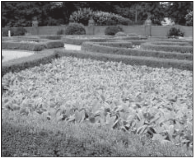
In the formal boxwood garden, Stachys 'Helen Von Stein" fills in the boxwood outline. This lambs ear cultivar does not flower extensively.