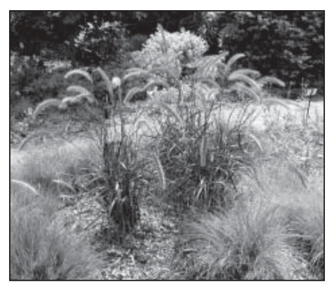
Pennisetum 'Purple Majesty' was admired by our group. A future "Plant of Merit"?

These lists will be revised, but all of the plants of merit will continue to be listed. Check the website at http://www.mobot.org/gardeninghelp/ merit/index.shtml for current information.