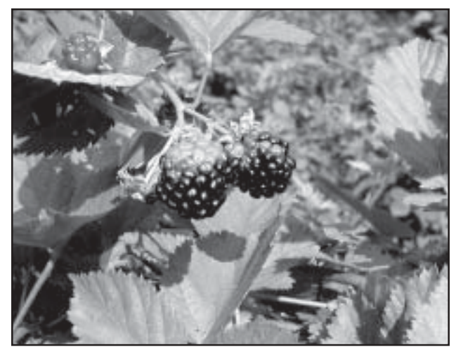
See the "blond" drupelets on the upper part of the blackberries exposed to the sun.

pigments of a ripe druplet, and the affected druplet does not develop color. Few growers consider insecticide applications for stink bug or tarnished plant bug, which would need to be applied soon after blossoming and at intervals for several cover sprays. Another cause of blond or reddish areas in ripe fruit is sunburn or sunscald. Exposure of the ripening fruit to UV radiation and high temperatures can result in damage, particularly on the upper (exposed) side of the berry and if the berry is wet. Cooler temperatures will resolve this problem.