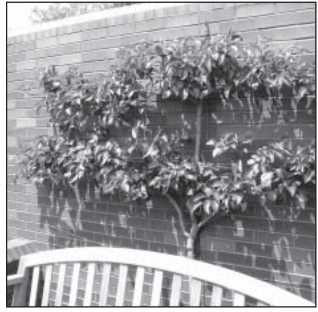
An espalier apple provides a beautiful focal point in the Enabling Garden in the Kemper Center.

We were very pleased to bring back many great ideas that can be used in the development of the Horticulture Demonstration Area at the State Fruit Experiment Station at Mountain Grove.