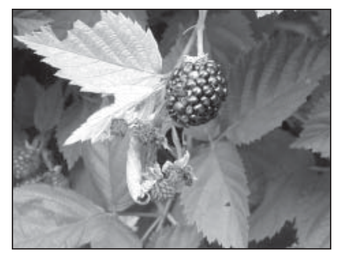
Blackberry affected by fireblight.

An interesting disease reported this year is bramble fireblight. This disease is caused by the same species of bacteria that causes fireblight in apple and pear. Infections can take place at the cane tip and progress down the cane, resulting in the death of all or part of the cane. Fireblight may also cause the death of the tips of fruiting clusters (the symptom noted in Missouri). Usually the 4-5 youngest flowers or berries are affected, with the older berries appearing normal. The affected flowers or young fruit turn brown and then dry, remaining attached to the fruiting cluster. In severe cases, 65% or more of the crop may be lost. At present, there are no labeled chemicals to prevent fireblight. Control measures include removal of infected tissue and encouraging good air movement in the planting through proper pruning.