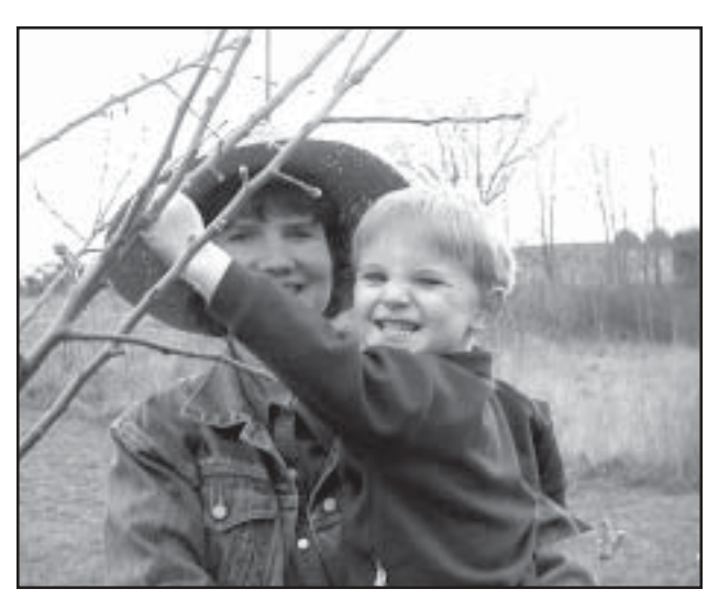
Cover photo for the web version of Growing Fruit for Home Use.

Cultivar recommendations have been updated from the printed bulletin based on recent research findings from our cultivar trials. The revised cultivar recommendations are as listed below. If you have a printed version of the Growing Fruit for Home Use Mimeo Series MS-18, you may want to keep this update with your printed copy.