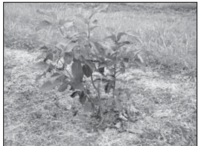
Several seeds are planted at each hill. The strongest of the resulting seedlings is grafted to the desired cultivar.

Jerry Lehman returned to the podium to discuss persimmon establishment and culture. Rootstock seeds are planted in the permanent site, 6 seeds to the hill. Hills are spaced 20 feet apart in rows 30 feet apart (75 trees per acre). The strongest seedling is grafted to the desired cultivar in the spring of the third year. Several grafting techniques