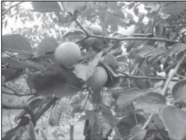
Nikita's Gift is an interspecific persimmon hybrid.