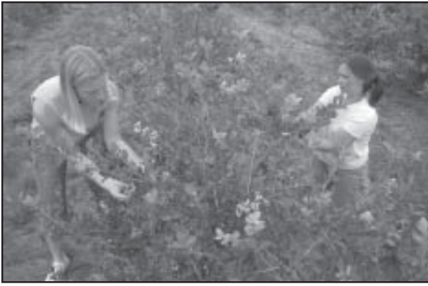
Highbush blueberries are one of the easiest fruit crops to harvest.

Reason # 8. Great Variety Choices. Several varieties (cultivars) of highbush blueberries are recommended for planting in Missouri. While plants of different varieties vary slightly in physical properties (size, growth pattern, new cane production) and in berry characteristics (number, size, taste, color, maturity dates), they produce high yields of quality fruit. Varieties differ in ripening dates, with early-ripening varieties normally producing the first ripe berries in early June; mid-season varieties begin ripening in late June; and the late-season varieties in early to mid July. Since most of these varieties produce ripe berries for about 4 weeks, the actual berry harvest can be as short as 4 weeks or extended to 12 weeks by selecting varieties with different times of ripening.