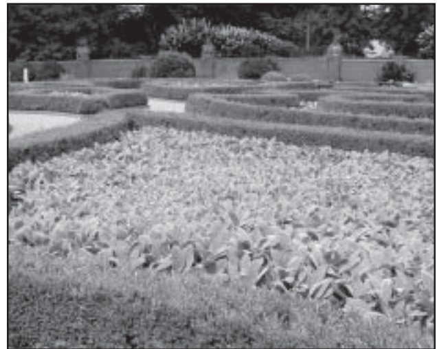
In the formal boxwood garden, Stachys 'Helen Von Stein' fills in the boxwood outline. This lambs ear cultivar does not flower extensively.