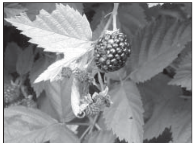
Blackberry affected by fireblight.

An interesting disease reported this year is bramble fireblight. This disease is caused by the same species of bacteria that causes fireblight in apple and pear. Infections can take place at the cane tip and progress down the cane, resulting in the death of all or part of the cane. Fireblight may also cause the death of the tips of fruiting clusters (the symptom noted in Missouri). Usually the 4-5 youngest flowers or berries are affected, with the older berries appearing normal. The affected flowers or young fruit turn brown and then dry, remaining attached to the fruiting cluster. In severe cases, 65% or more of the crop may be lost. At present, there are no labeled chemicals to prevent fireblight. Control measures include removal of infected tissue and encouraging good air movement in the planting through proper pruning.