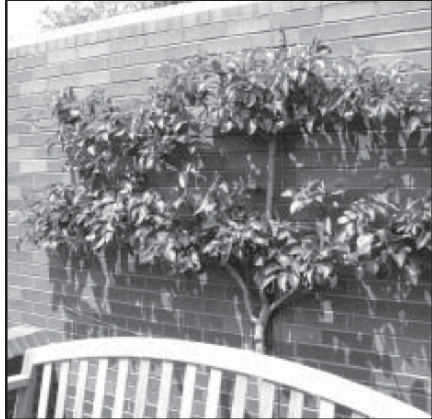
An espalier apple provides a beautiful focal point in the Enabling Garden in the Kemper Center.

We were very pleased to bring back many great ideas that can be used in the development of the Horticulture Demonstration Area at the State Fruit Experiment Station at Mountain Grove.