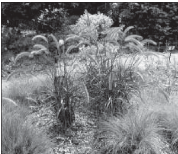
Pennisetum 'Purple Majesty' was admired by our group. A future "Plant of Merit"?

These lists will be revised, but all of the plants of merit will continue to be listed. Check the website at http://www.mobot.org/gardeninghelp/merit/index.shtml for current information.