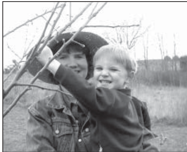
Cover photo for the web version of Growing Fruit for Home Use.

Cultivar recommendations have been updated from the printed bulletin based on recent research findings from our cultivar trials. The revised cultivar recommendations are as listed below. If you have a printed version of the Growing Fruit for Home Use Mimeo Series MS-18, you may want to keep this update with your printed copy.