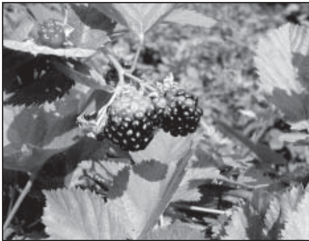
See the "blond" drupelets on the upper part of the blackberries exposed to the sun.

pigments of a ripe drupelet, and the affected drupelet does not develop color. Few growers consider insecticide applications for stink bug or tarnished plant bug, which would need to be applied soon after blossoming and at intervals for several cover sprays. Another cause of blond or reddish areas in ripe fruit is sunburn or sunscald. Exposure of the ripening fruit to UV radiation and high temperatures can result in damage, particularly on the upper (exposed) side of the berry and if the berry is wet. Cooler temperatures will resolve this problem.