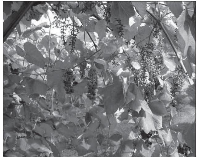
Bird depredation on Norton/Cynthiana.

Cluster integrity is very important. It is great if you can wait until the grapes are at peak ripeness for the wine you wish to make, however, if the clusters are damaged (cracking from rain or damage from hail) and begin to rot, you have to harvest in order to salvage the crop. If you see bird depredation and you cannot net the crop to protect it from the birds, you may have to pick early before the birds harvest your