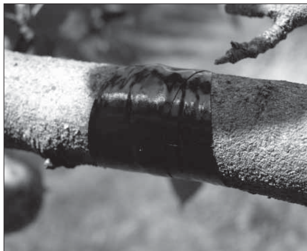
Figure 6. Dark sticky tape, used for monitoring crawlers. Note crusty accumulation of scale.