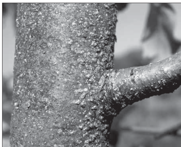
Figure 4. Heavy infestation of SJS on apple branch