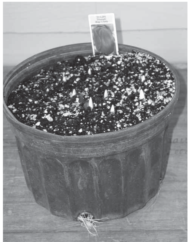
A simple pot of tulips is ready to grow when the roots are seen at the bottom of the pot. Just place in a warm, sunny window to grow and brighten up the dormant season.

(checks payable to Missouri State Fruit Experiment Station)