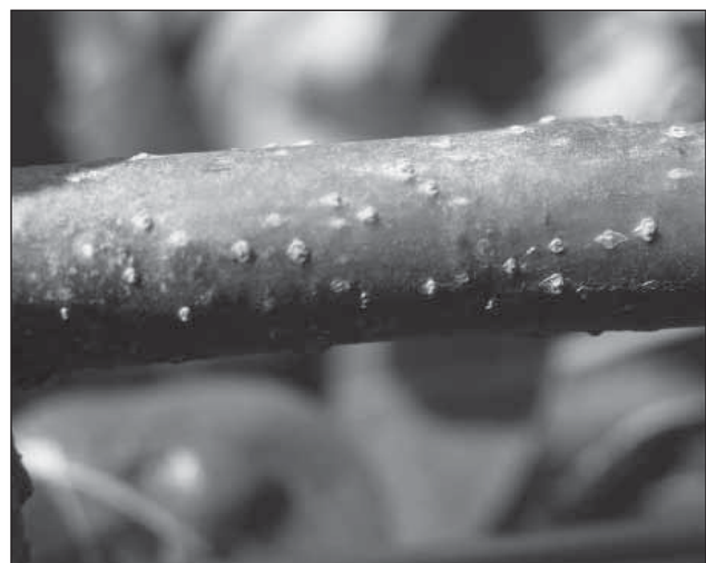
Figure 3. SJS feeding sites on young twig