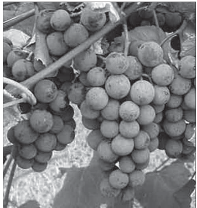
The mighty Concord is an excellent, all purpose grape for Missouri home growers. Concord wine is best made in a sweeter style.

It is best to get a sugar level of 21 to 24 degrees Brix (percent) in the juice, but some varieties such as Concord, Catawba and Cayuga white, don't usually reach those levels, so additional sugar must be added to the juice before winemaking.