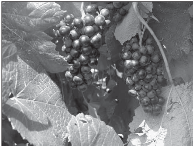
Norton/Cynthiana is the state grape of Missouri.

home winemaker a wonderful spectrum of possibilities. They include red varieties such as Chambourcin, Concord, St. Vincent, Vincent and Norton/Cynthiana, pink varieties such as Catawba and Delaware, and white varieties such as Cayuga White, Seyval blanc, Vidal blanc, Traminette, Chardonel, and Vivant. If you decide on the fresh fruit option, you may be able to obtain grapes or juice from a commercial vineyard or you may even consider growing your own grapes. Keep in mind that, although some varieties like Norton/Cynthiana and Concord exhibit disease resistance, grapes generally require pesticide applications to manage fungal diseases. If you decide to plant grapes, note that a mature vine will yield from 10 to 15 pounds of grapes and you need about 15 pounds of grapes to yield 1 gallon of juice.