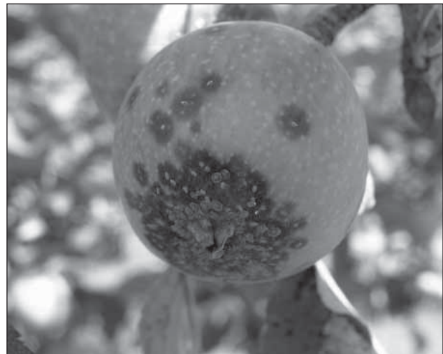
Figure 2. Heavy infestation of SJS on apple