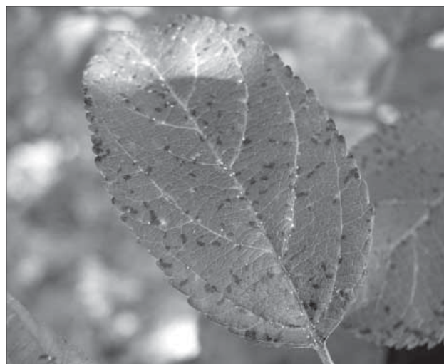
Figure 5. Heavy infestation of SJS on apple foliage