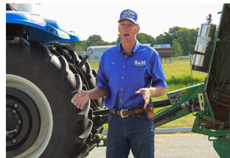
Representative from S&H speaking about tractor safety.

With the help of the Polk County Cattlemen’s Association, group members were able to serve lunch to visiting students and teachers leaving with a positive experience and excitement toward next year. Join the MSU Cattlemen’s next year for more valuable discussions over farmer safety.