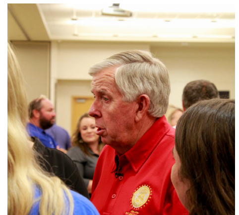
Gov. Parson speaking with students.

To keep updated with the latest news from Parson, visit his website at governor.mo.gov .