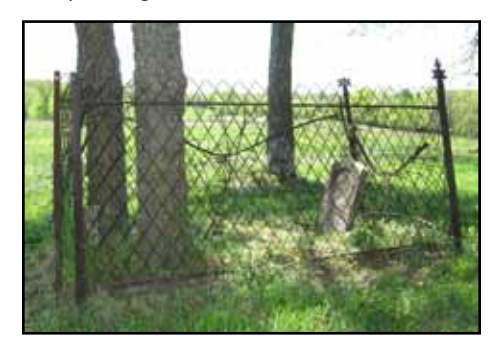
Gravesite of Richard V. Durham

Standing near the lone gravesite, located at such a serene and remote location on the beautiful Journagan Ranch, it is indeed very difficult to imagine the brutal murder that occurred there nearly 150 years ago.