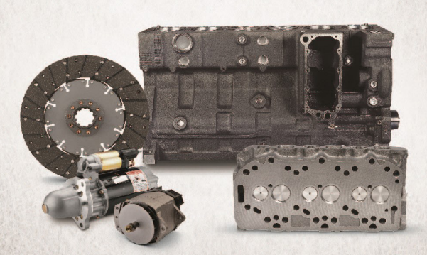
To learn more, visit mycnhreman.com