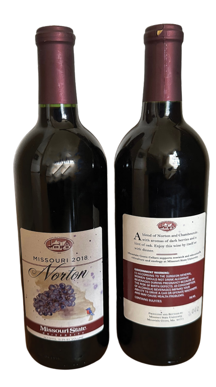
Two of Missouri State University Norton wine displaying TTB's requirements.

The USDA's Agricultural Marketing Service (AMS) provides American agriculture with valuable tools and services, such as grading, certification, and verification, that help create marketing opportunities.