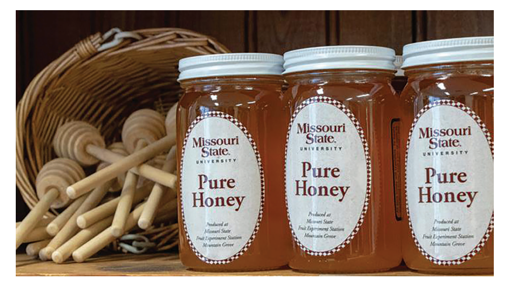
Pure honey is produced from the hives located at Shealy Farm , the Darr Agricultural Center, and the Fruit Experiment Station.

Before the wine or spirit is ready to be purchased by consumers, producers perform a menthol test to ensure there is no menthol in the product. The labels also require declaration if there is sulfites in the wine or spirit. Sulfites, also known as sulfur dioxide, are naturally occurring and