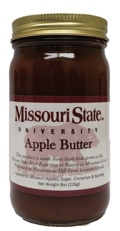
Apple butter is made from products grown at the Fruit Experiment Station and is manufactured at the station.

The nutrition facts panel underwent another significant overhaul in 1990. The new label