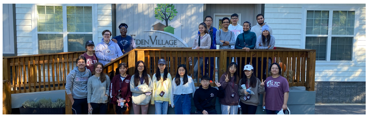
Three-plus-one students pictured at Eden Village during a community service project completed for class credit.

Missouri State University and Southwest University are tirelessly working on the planning and execution of the program. They work on how to increase the program and how to make it a successful experience for all of the parties involved.